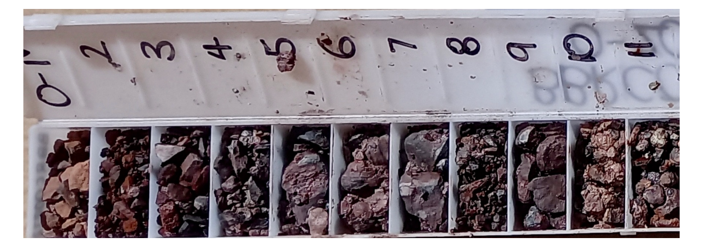
Figure 2. Lateritic manganese mineralisation intercepted in exploration drilling at the Butcherbird Project