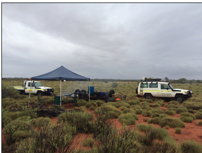
Figure 1: Field crews undertaking infill soil sample collection to confirm and refine historic gold anomalies at the Yamarna Project.