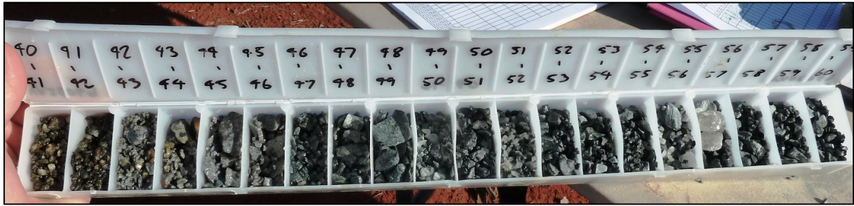
Figure 1: Sericite/biotite alteration with quartz veining and sulphides in YARC069.