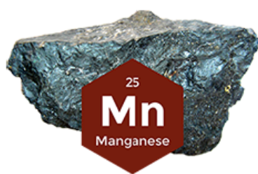
LARGE MANGANESE RESOURCE