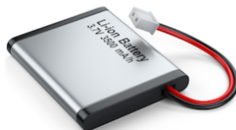
HIGH PURITY MANGANESE PRODUCTS

Work is now focussed on the production of a crystalline manganese sulphate product that meets the specifications of Li-Ion battery cathode manufacturers.