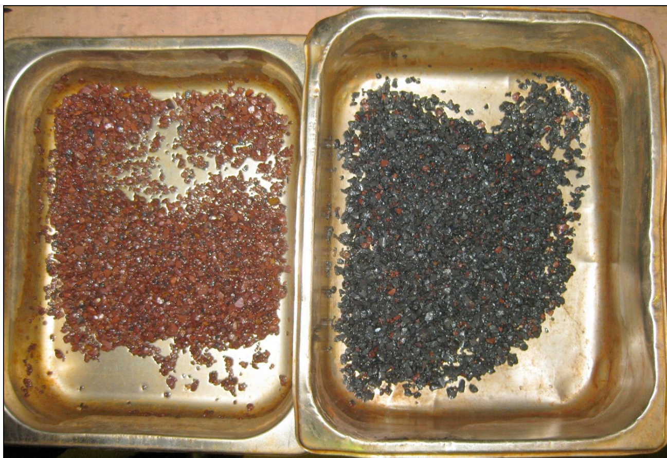
Figure 2: Composite 208-2, DMS Tail on left, DMS Concentrate on right.