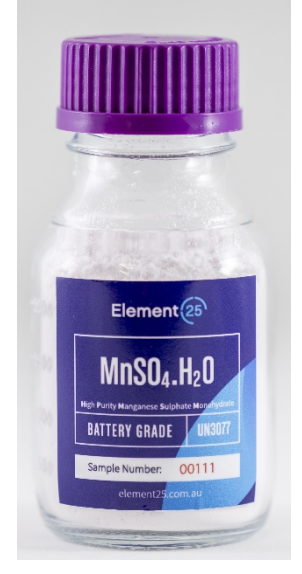
Figure 3: E25 HPMSM Sample.

The programme also yielded significant quantities of HPMSM which has been packaged and stored in suitable conditions before being dispatched to our existing offtake partners as well as potential future offtake and funding partners to assist in ongoing discussions.