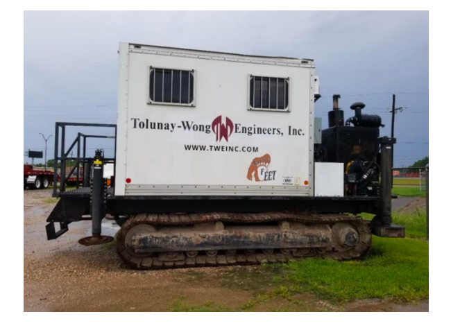
Figure 1: Cone penetration test (CPT) track mounted rig.

All critical surveys completed with minor potential wetlands areas covering approximately 400 m<sup>2</sup> identified for follow up with USACE.