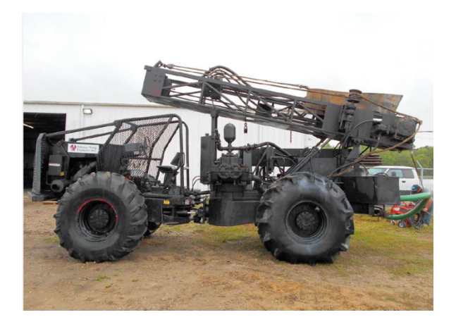
Figure 2: Soil test borehole drilling rig.