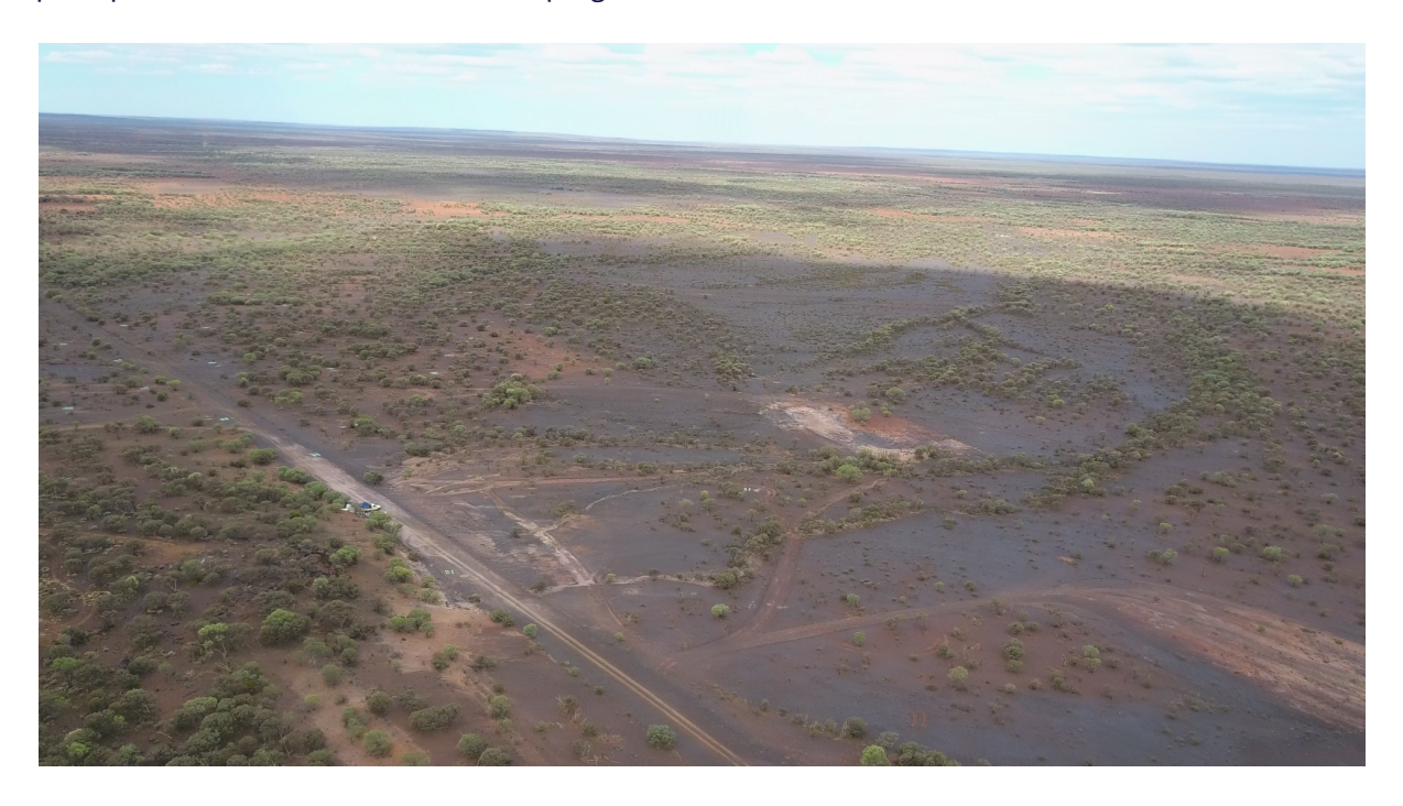
Figure 4: View from Butcherbird looking South East over the potential processing area. February 2019.

Stygofauna and troglofauna surveys will be conducted in the next two quarters and will be integrated into the plant process water source assessment program.