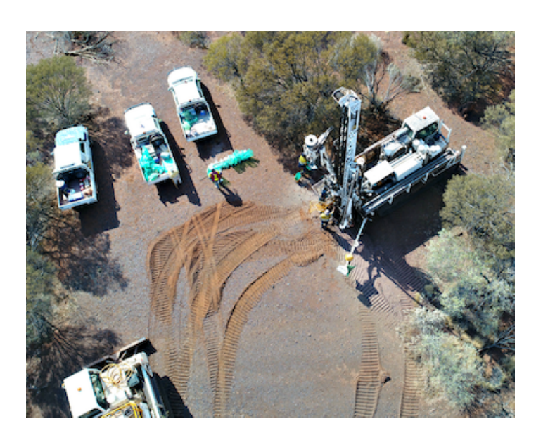
Figure 1: Resource drill-out at the Butcherbird Project.

A resource infill drilling programme comprised 210 aircore holes for a total of 6,672m was completed in the December 2018 quarter. The assay results and geological logging of the drill holes both compare favourably with the existing drilling data in terms of geology as well as mineralised widths and grades of the ore zone, confirming the robustness of the current understanding of the deposit.