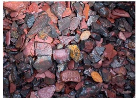
Figure 2 Scrubbing and screening removes clavs