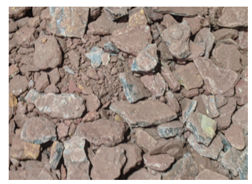
Figure 1 Bulk manganese ore post crushing

Market studies have confirmed that the concentrate grade and levels of deleterious elements are suitable for the