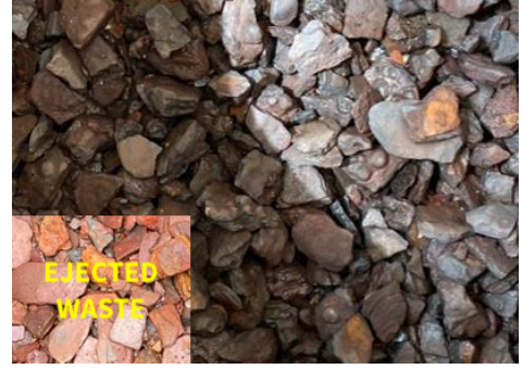
Figure 3 Ore sorting removes additional waste to improve concentrate grade to 33% Mn.

production of ferromanganese and silicomanganese alloys. Additionally, there are a number of unique characteristics that may make this product suitable for premium niche markets.