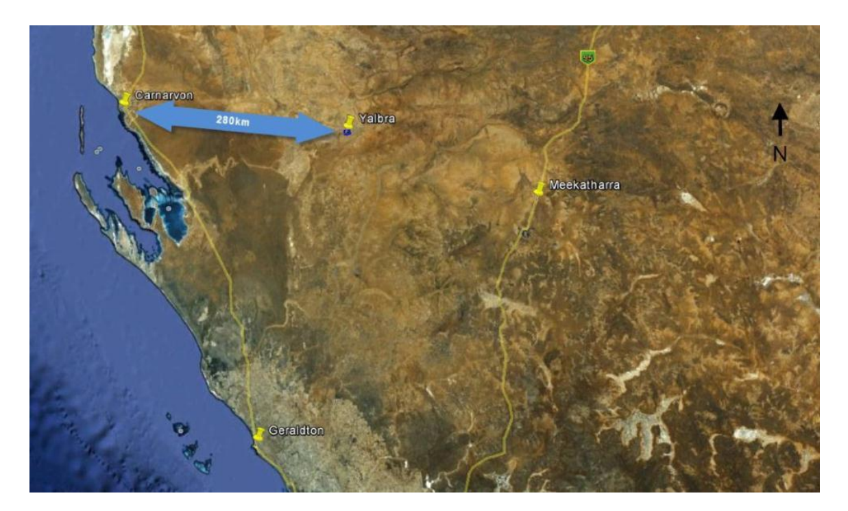
Figure 1: Location of the Yalbra Graphite Project

The tenement E09/1985 is in the application stage and covers an area of approximately 37 square kilometres.