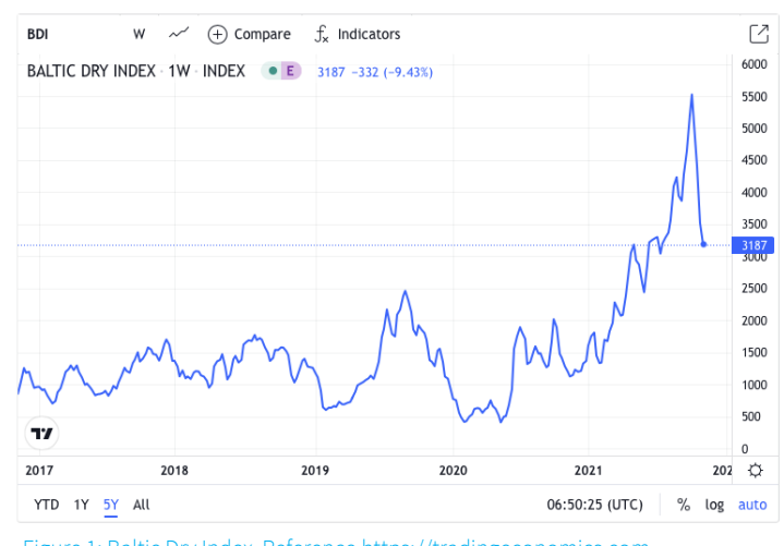
Figure 1: Baltic Dry Index. Reference https://tradingeconomics.com

The Baltic Dry Index is a proxy for global shipping costs and has been at historically record high levels in 2021 (see Figure 1), reflecting these higher shipping tariffs experienced through the affected period. Timing for the first two shipments from the Project coincided with these elevated levels, which resulted in higher cost of sales,