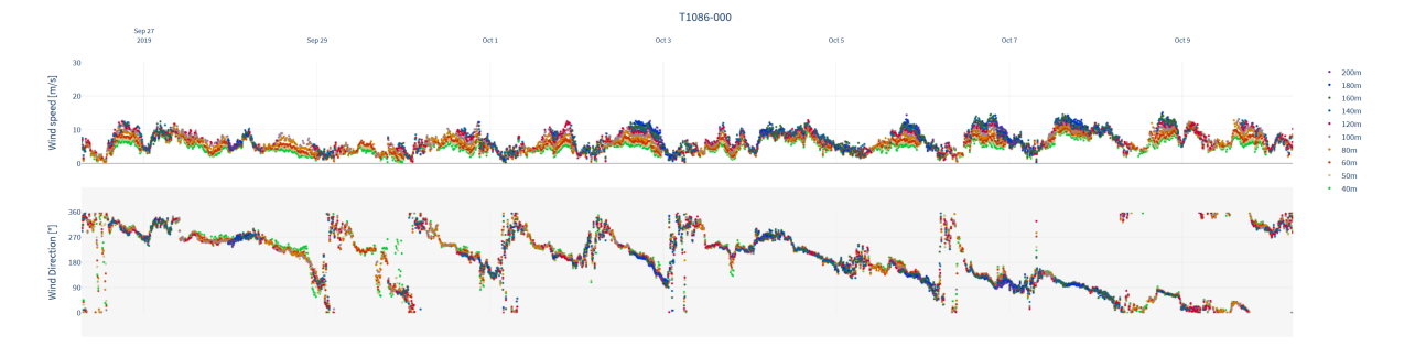
Figure 3: SODaR wind data collected at Butcherbird during September 2019.