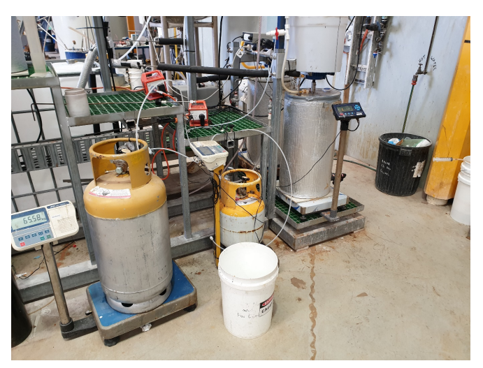
Figure 1: Manganese leaching test equipment.

The test programme has successfully yielded a high purity Electrolytic Manganese Metal product grading 99.9% Mn, which exceeds the required purity for commercial sale.