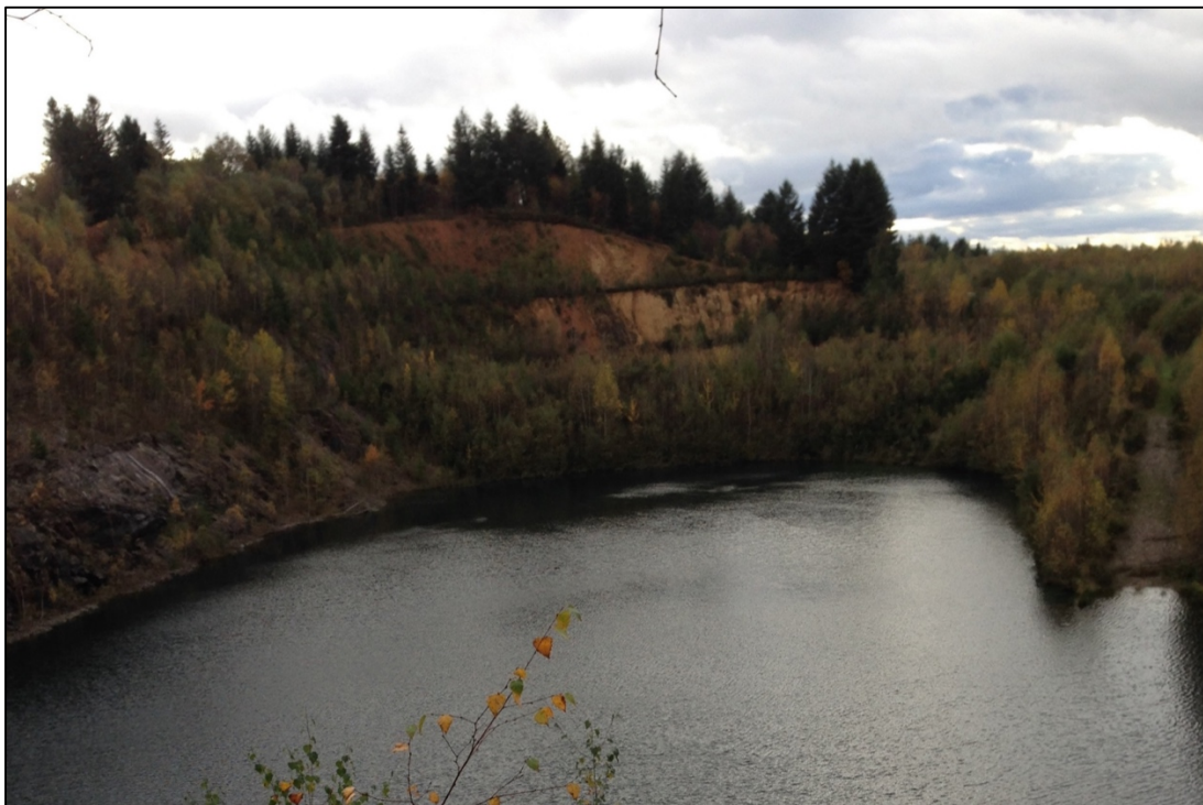
Photo 1: Historical open pit at the Laurieras Gold Mine, St Yrieix District, Limousin.